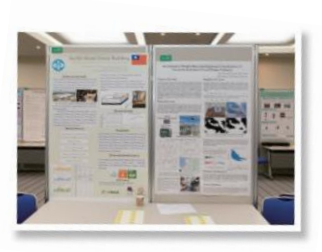
The poster presentation (Last Year)