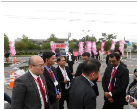
July 19 [Observation] Street speech