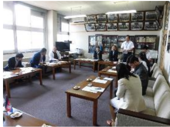
July 20 [Briefing] Kawanishi Town Board of Elections