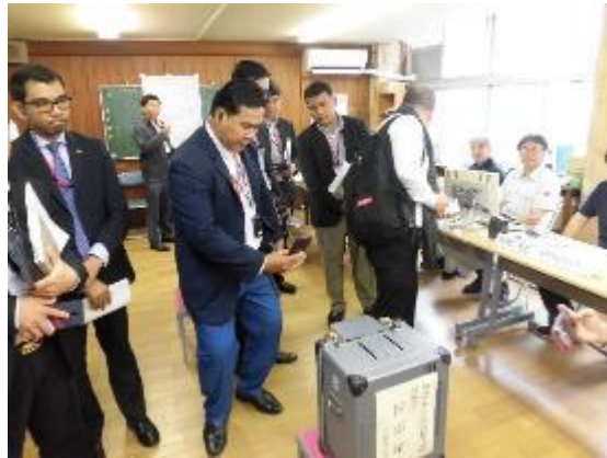
July 20 [Observation] Advance polling place in Kawanishi town