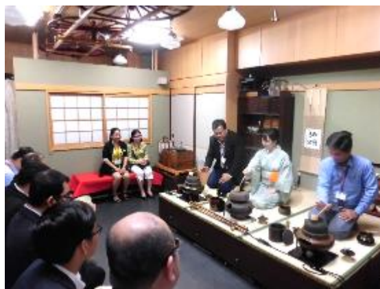
July 22 [Experience] Tea ceremony in Asakusa