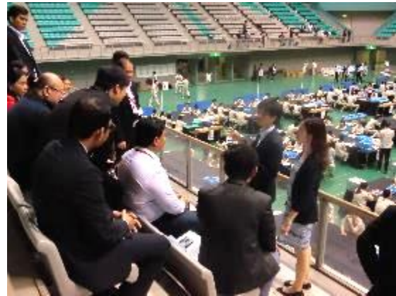
July 21 [Observation] Voting and vote counting for House of Councilors election