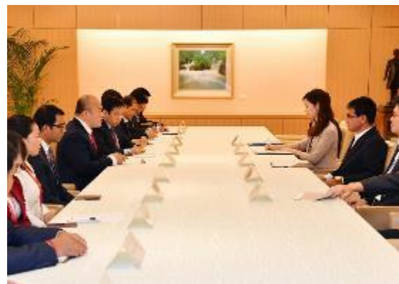
July 24 [Courtesy visit] Foreign Minister Kono