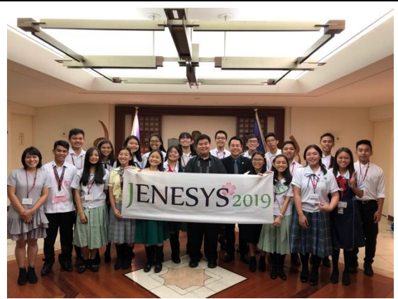
October, 29 [Courtesy Call] Embassy of the Republic of the Philippines in Japan