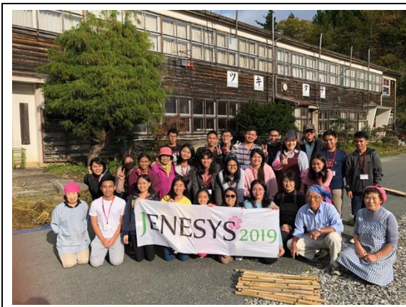
October, 26 [Japanese Language, Culture /Home-stay] Stay at a private house