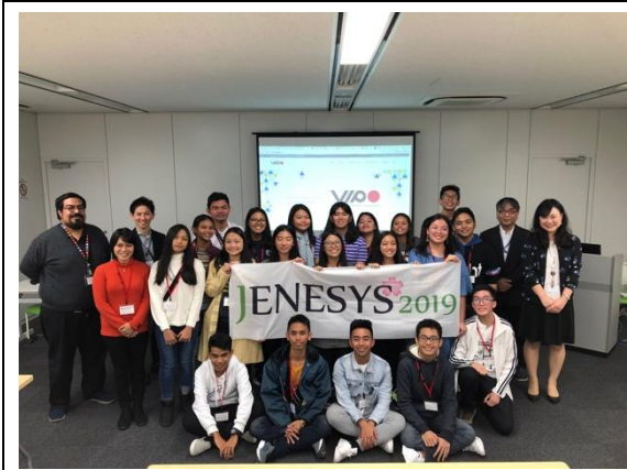
October, 28 [Japanese Language, Culture/ Theme-related observation] VIPO