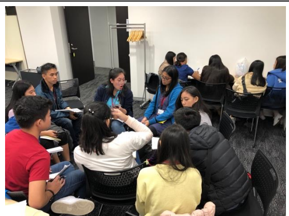
October, 30 [Workshop]