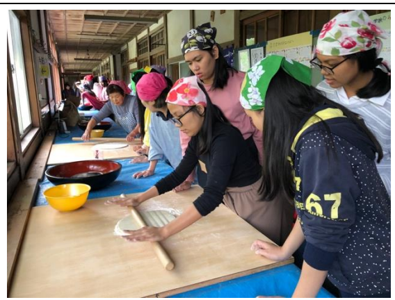
October, 27 [Japanese Language, Culture] Experience: Soba Making