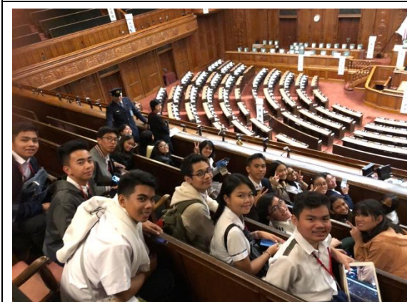
October, 29 [Japanese Language, Culture/ Theme-related observation] The National Diet Building