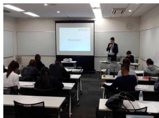
October 29th 【Theme-related Lecture】 JTB Corp. “Prospects on Tourism Industry in Japan”