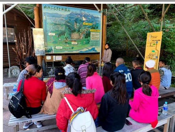
November 1st 【Theme Related Observation/Courtesy Call】 Gero City Eco-Tourism Promotion Council “Initiatives of Gero City Eco-Tourism Promotion Council”