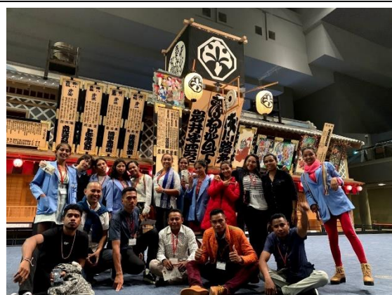
October 30th 【Theme-related Observation】 Edo Tokyo Museum