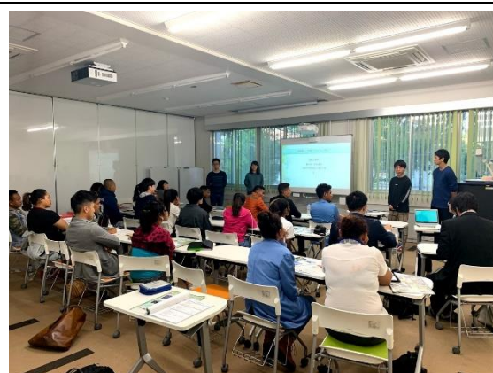
October 31st 【Theme-related Lecture/Exchange】 Gifu University Faculty of Regional Studies