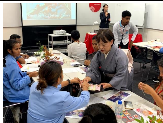
October 30th 【Theme-related Lecture】 Tunaguhirogeru Omotenashi Association “OMOTENASHI Workshop”