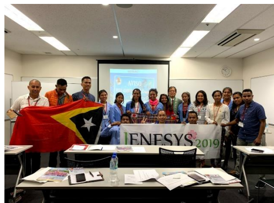
October 30th 【Theme-related Lecture】 Japan Timor-Leste Association “Relationship between Japan and Timor-Leste”