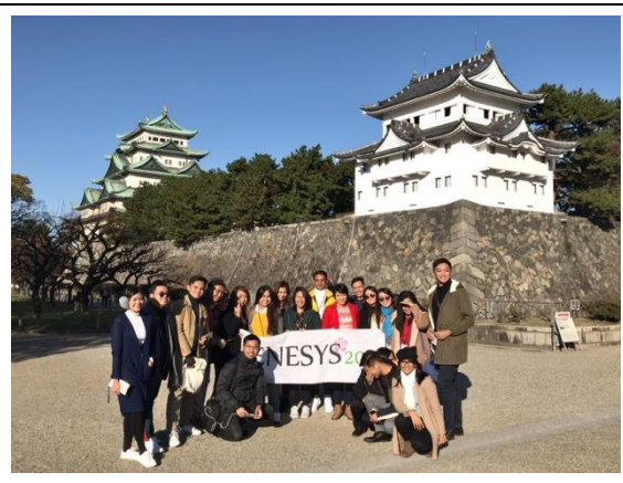
November, 30 【Japanese Culture observation】 Nagoya Castle