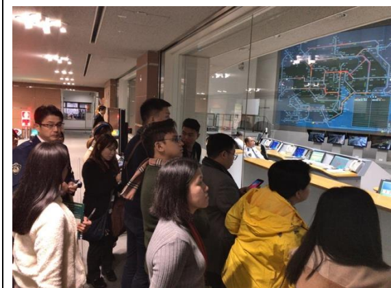
November, 28 【Infrastructure/Theme-related observation】 Traffic Control Center