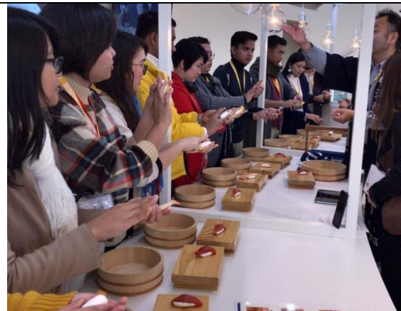
November, 30 【Japanese Culture observation】 MIZKAN MUSEUM