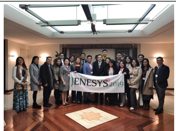
November, 26 【Courtesy Call】

Embassy of the Republic of the Philippines in Japan