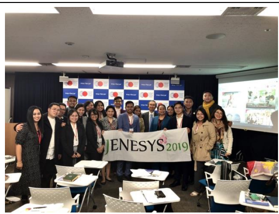
November, 26 【Media /Theme-related lecture】 Foreign Press Center Japan