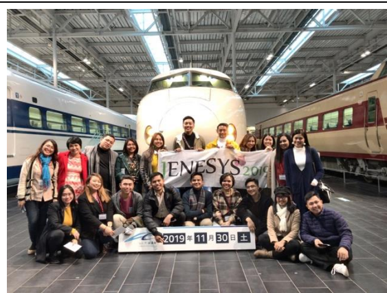
November, 30 【Infrastructure/Theme-related observation】 SCMAGLEV and Railway Park