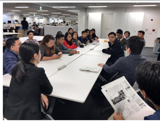
November, 29 【Media/Theme-related observation】 The Asahi Shimbun, Nagoya Office