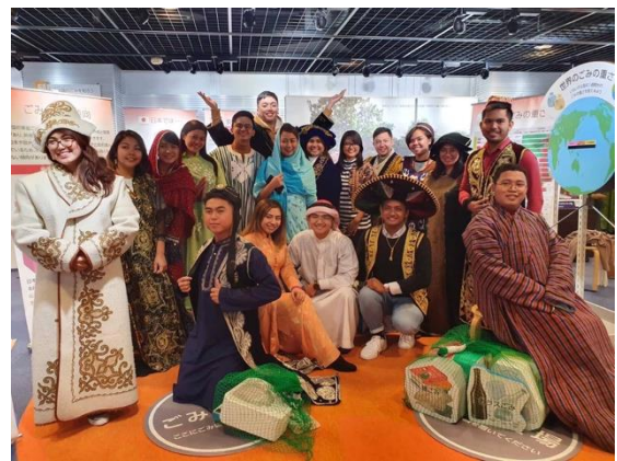
November, 27 【Infrastructure /Theme-related lecture】 Japan International Corporation Agency (JICA)