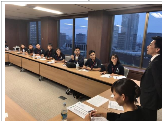
November, 25 【Orientation】