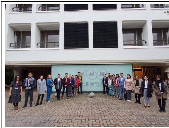
November, 26 【Media/Theme-related observation】 NHK Museum of Broadcasting