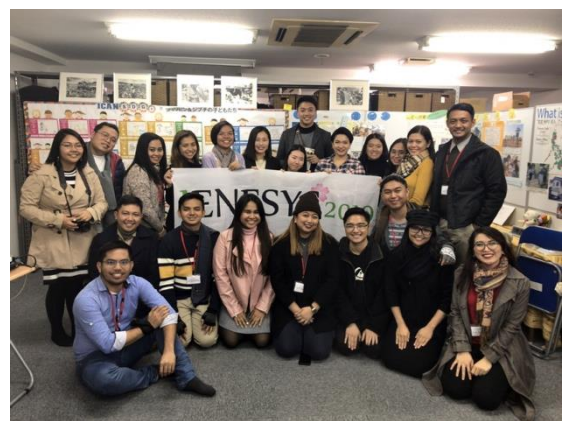
November, 28 【Infrastructure/Theme-related observation】 ICAN (International Children's Action Network)