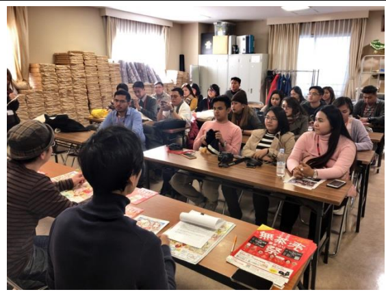
November, 29 【Japanese Culture observation】 Osu Shopping Street