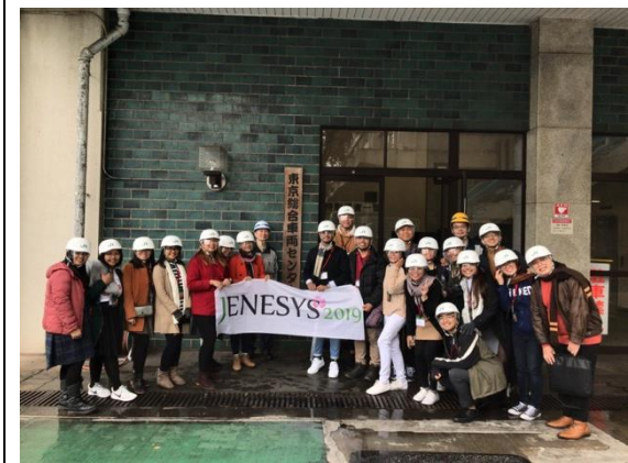
November, 27 【Infrastructure /Theme-related observation】 East Japan Railways Company