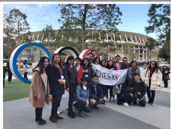
December, 1 【Olympics/Paralympics-related facility observation】 Tokyo National Museum