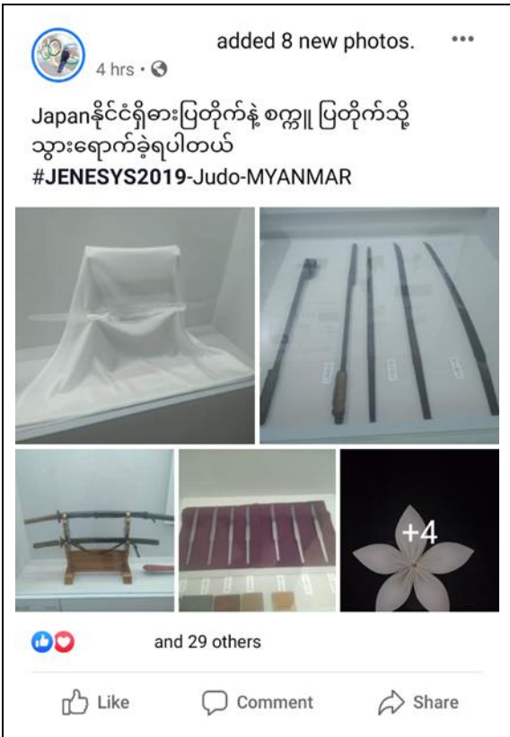
Posting about Japanese Sword Museum (Facebook)