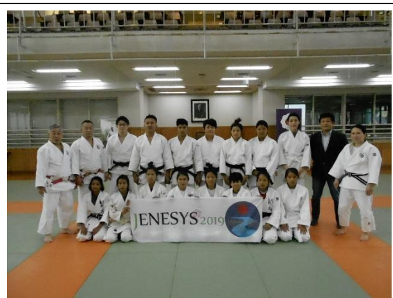
January 24th 【Sports Exchange】 KODOKAN Judo Institute