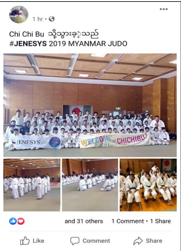
Posting about Judo Exchange at ChiChibu City (Facebook)