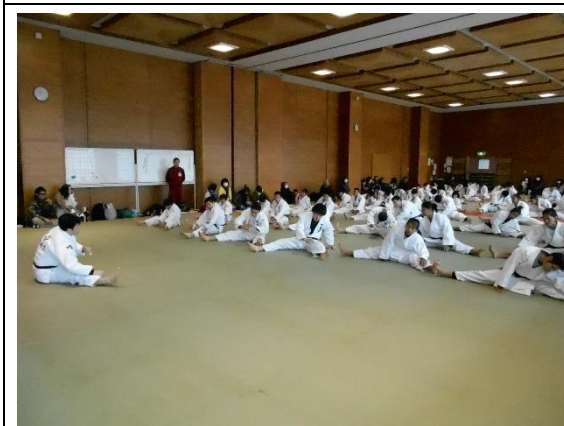
January 26th 【Sports Exchange】 Chichibu Judo Association, Grade Test