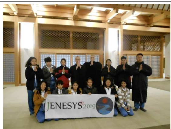
January 27th 【Cultural Experience】 Daihonzan Soji-Ji temple