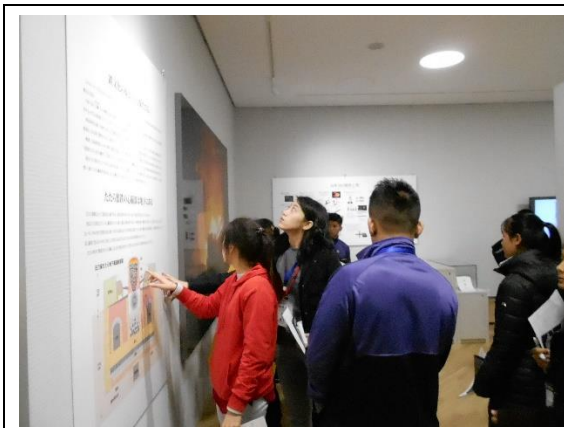
January 24th 【Cultural Observation】 The Japanese Sword Museum