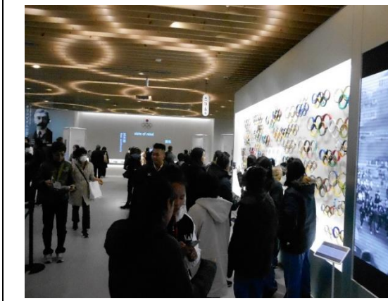
January 21st 【Observation】 Japan Olympic Museum