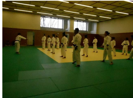
January 23rd 【School Exchange】 Josai University