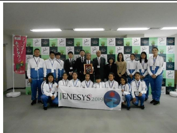
January 23rd 【Courtesy Call】 Tsurugashima City, Saitama Prefecture