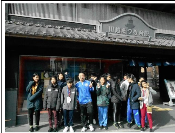
January 25th 【Cultural Observation】 Kawagoe