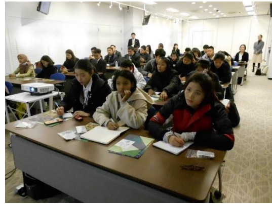
January 22nd 【Lecture】 ASEAN-JAPAN Center