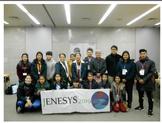
January 25th 【Homestay】 Welcome Ceremony with Host Family