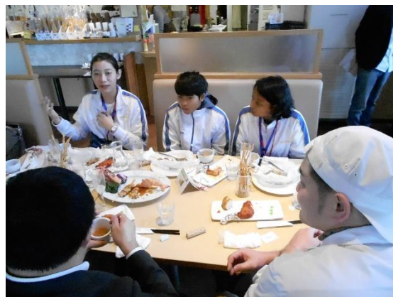
January 23rd 【Exchange】 Lunch meeting with Host Town Stakeholders