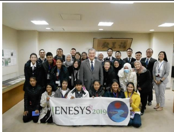
January 22nd 【Lecture/Exchange】 KODOKAN Judo Institute