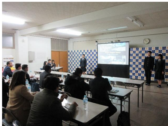
January 27th 【Exchange】 Tokushima Commercial High School