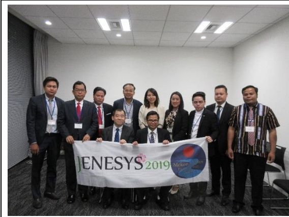
January 30th 【Reporting Session】