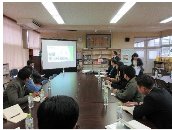
January 25th 【Exchange】 Kamiita Town, Takashi Elementary School