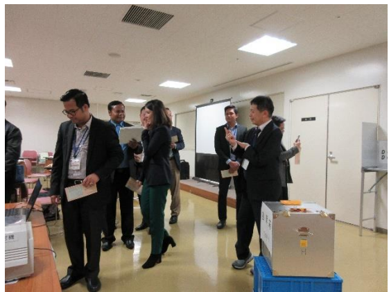
January 25th 【Observation】 Voting Simulation