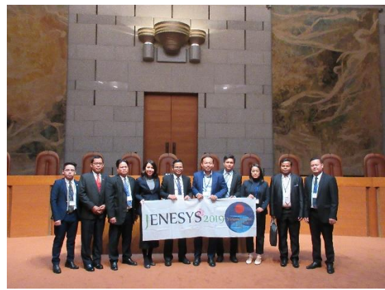
January 24th 【Observation】 The Supreme Court