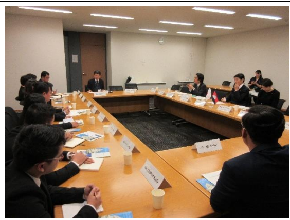
January 29th 【Courtesy Call】 Japan-Cambodia Parliamentary Friendship Association