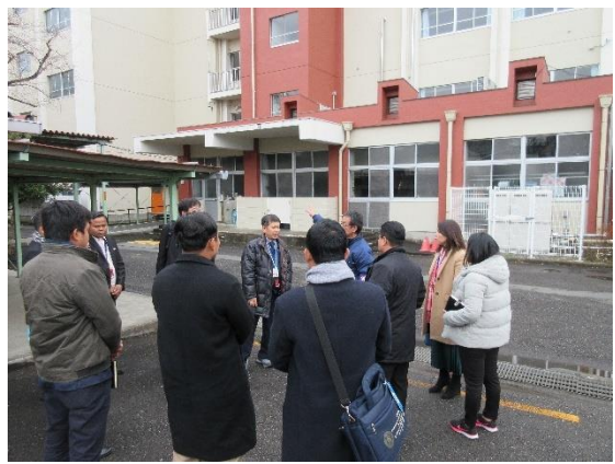
January 25th 【Observation】 Briefing from Election Administration Commissions of Hachioji City