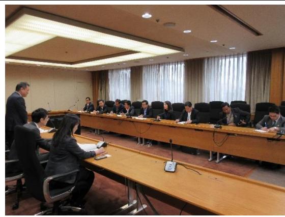
January 27th 【Courtesy Call】 Tokushima Prefecture