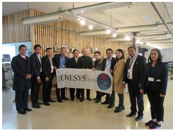
January 28th 【Observation】 Kamiyama Town (Satellite Office)