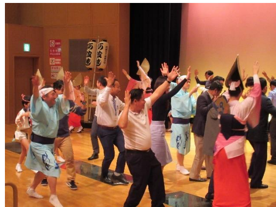
January 27th 【Observation】 Awa-odori Kaikan