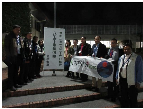
January 26th 【Observation】 Moto-Hachioji the 6th Polling Station