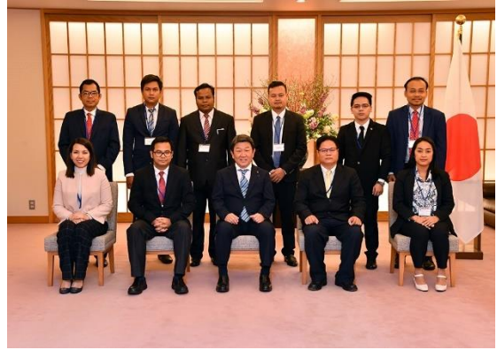
January 23rd 【Courtesy Call】 Ministry of Foreign Affairs (Foreign Minister Motegi)