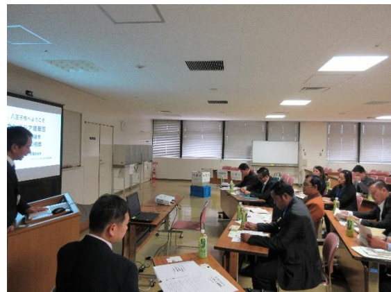
January 25th 【Observation】 Briefing from the Election Administration Commissions of Hachioji City