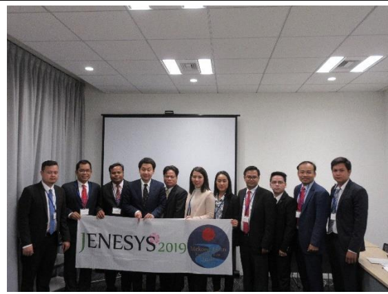
January 23rd 【Lecture】 Lecture from an Expert