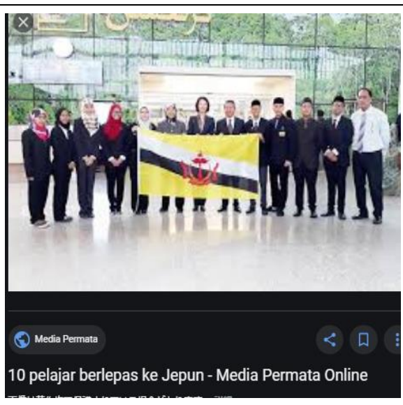
Posted by Indonesian newspaper when the participants departed to Japan: 10 journalists and 1 student departed to Japan (by HP and Newspaper)