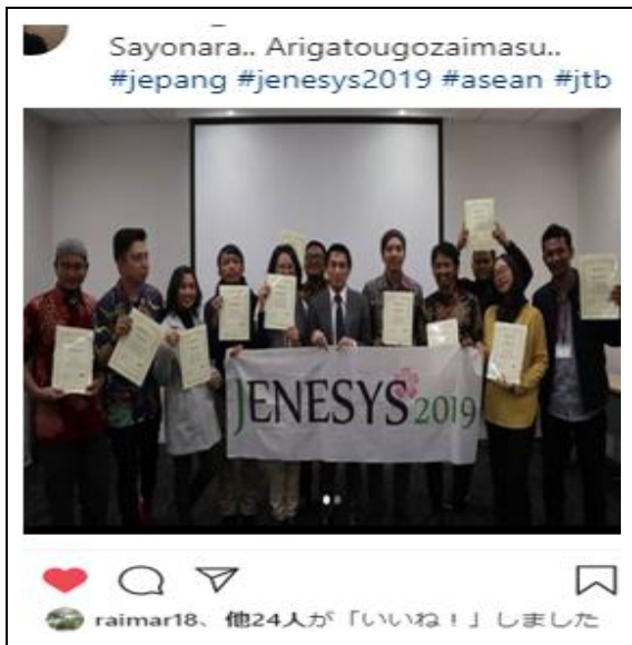
Posted at Reporting Session in Jenesys2019: Took a souvenir photo for everyone at final moment, Good-bye and Thanks a lot!