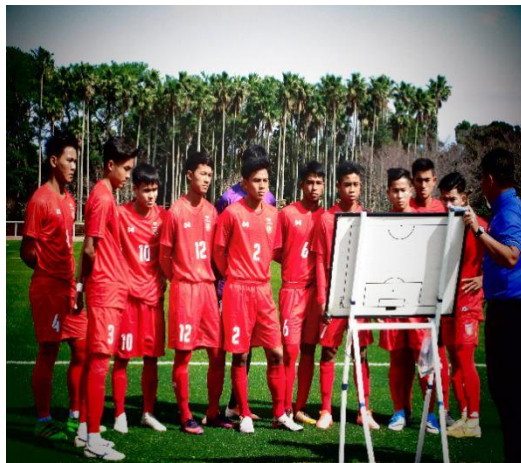
February 26th 【Sports Exchange】 Myanmar