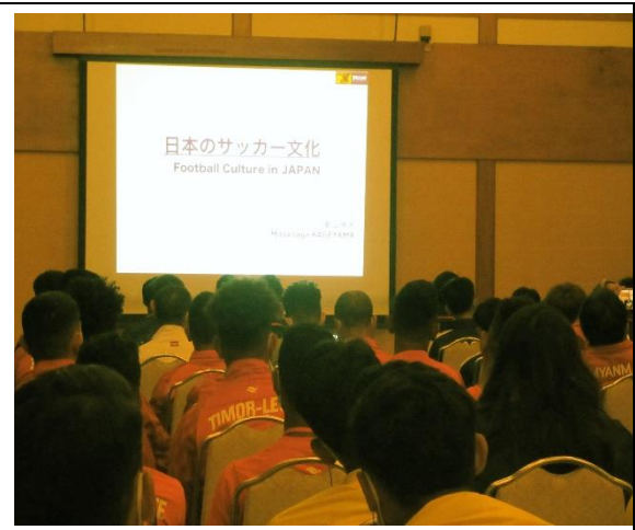
February 25th 【Lecture】 Japan Football Association