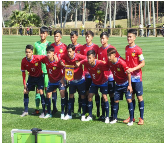
February 27th [Sports Exchange] Laos