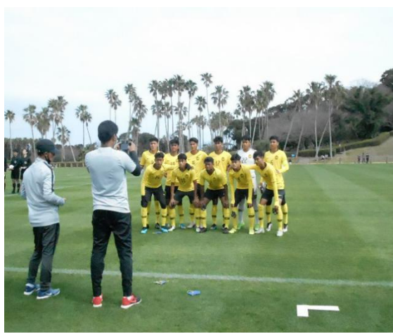
February 28th [Sports Exchange] Malaysia