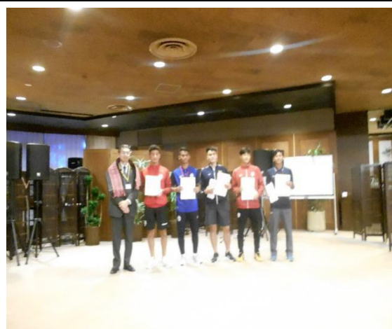
February 29th [Commendation Ceremony]