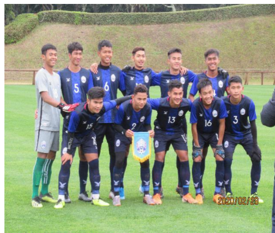
February 28th [Sports Exchange] Cambodia