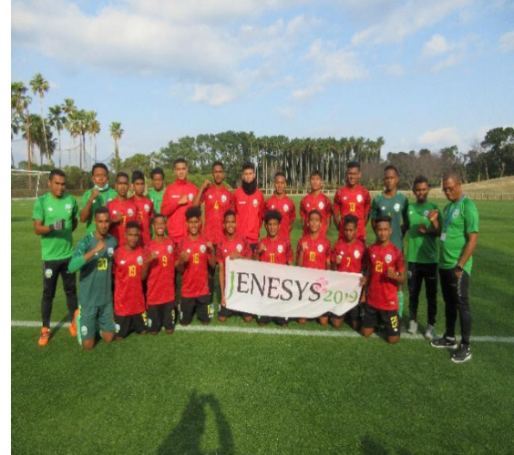
February 27th 【Sports Exchange】 Timor-Leste