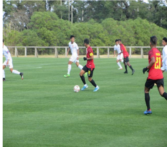
February 27th [Sports Exchange] Friendly Match