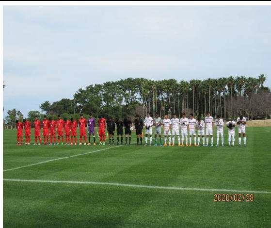
February 28th [Sports Exchange] Friendly Match