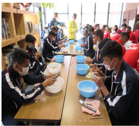
February 27th 【Japanese Craft Workshop】 Ibusuki Archaeological Museum