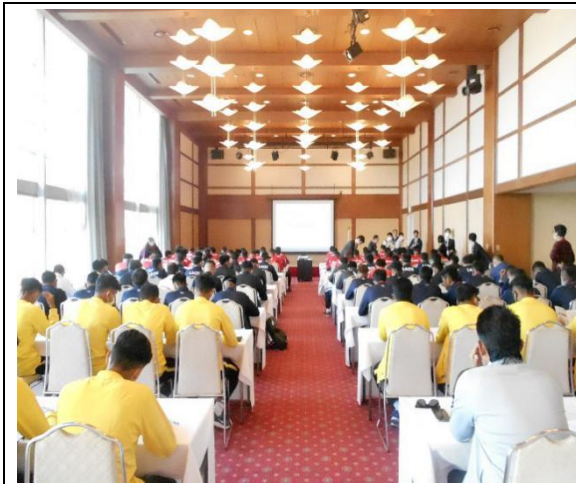
February 24th 【Orientation】