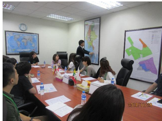
November 29th 【Observation】 Thilawa Industrial Park