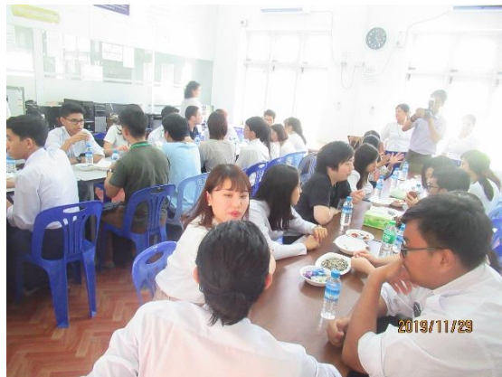
November 29th 【School Exchange】 Thanlyin Technological University