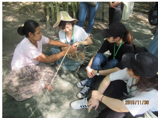
November 30th 【Home Visit】 Kyaikthale Village