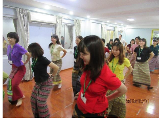
December 1st 【Traditional Culture Experience】 Workshop for Myanmar Dance