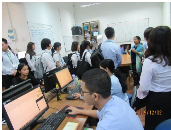
December 2nd 【Local Company Visit】 MSR