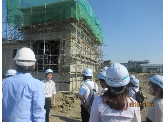
November 28th 【ODA site Visit】 Bago River Bridge Construction Project