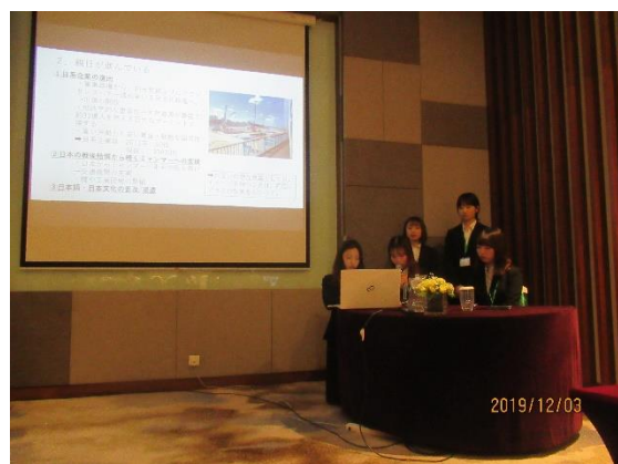
December 3rd 【Reporting Session】