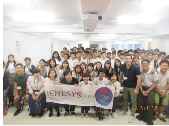
November 29th 【School Exchange】 Metro IT Japanese Language Center