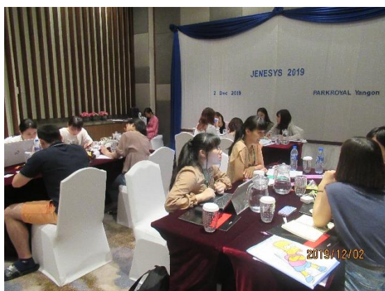
December 2nd 【Workshop】