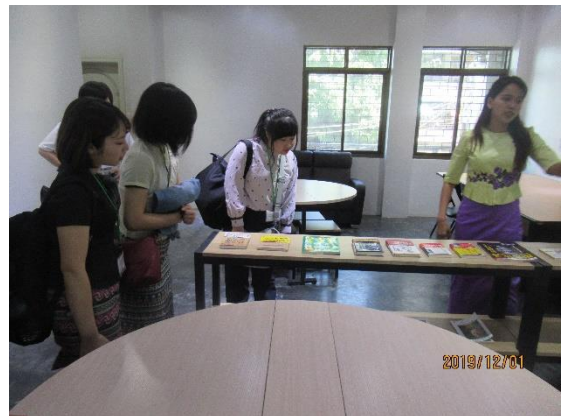
December 1st 【Observation】 Japan House -wa-