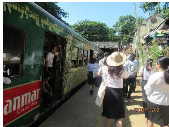
December 2nd 【Experience】 Local Railway Riding