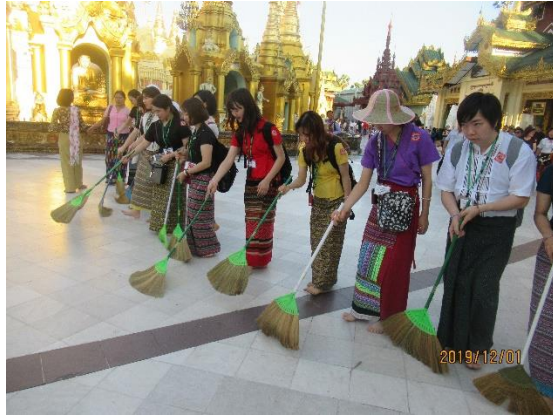
December 1st 【Observation】 Shwe Dagon Pagoda Volunteer Cleaning activity