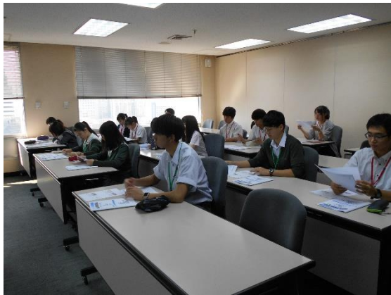
December 12 【Visit】 JETRO Bangkok Office