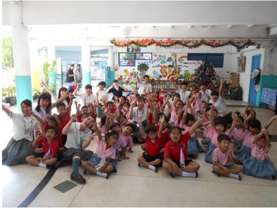
December 16 【Visit】 Duang Prateep Foundation