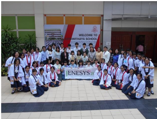
December 13 【School Exchange】 Satriwithaya School