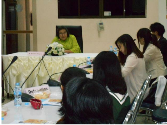
December 11 【Courtesy Call】 Office of Children and Youth Protection and Stability Support, Ministry of Social Development and Human Security