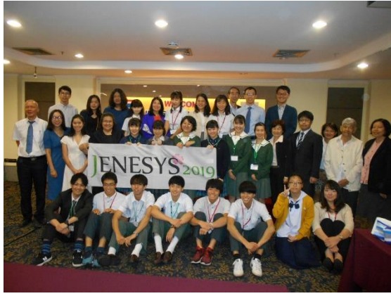
December 17 【Result Debriefing Session】