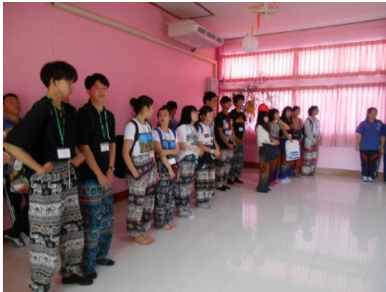
December 15 【Volunteer Experience】 Thai Orphan School Volunteer Program