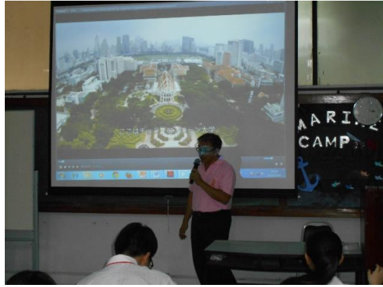
December 12 【Visit to ODA Site】 Chulalongkorn University