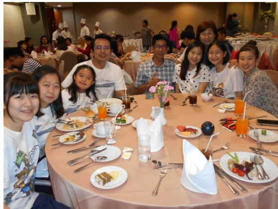
December 14 【Homestay】