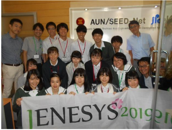
December 12 【Visit to ODA Site】 Bangkhen Water Treatment Plant