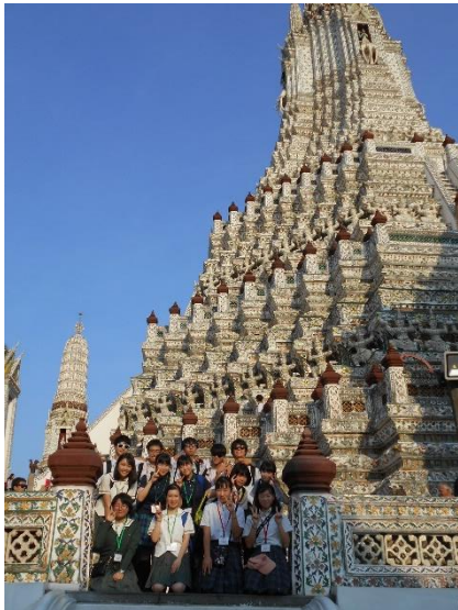
December 11 【Visits】 Bangkok City