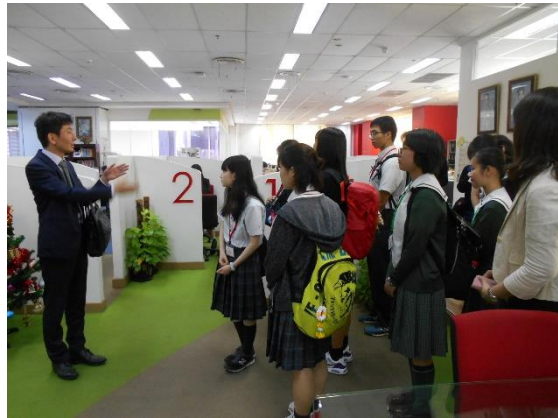
December 16 【Visits】 Personnel Consultant Manpower Thailand