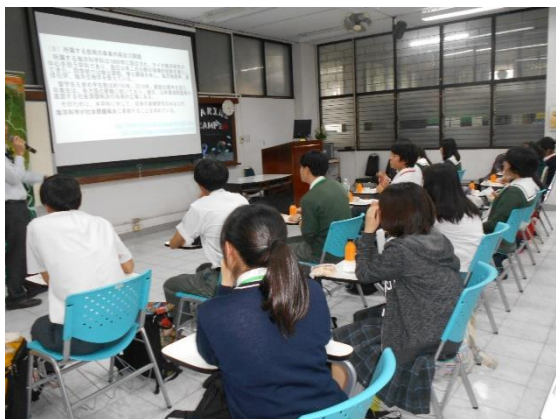
December 12 【Visit to ODA Site】 Laem Chabang Port