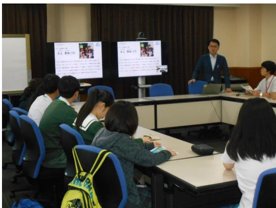
December 12 【Briefing】 JICA (Contribution of Japan to Thailand)