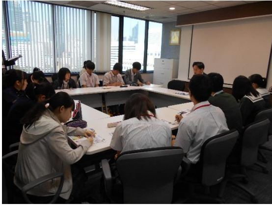
December 11 【Orientation】 Japanese Embassy in Thailand