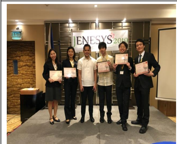
February, 11 【Conferment of Certificate】