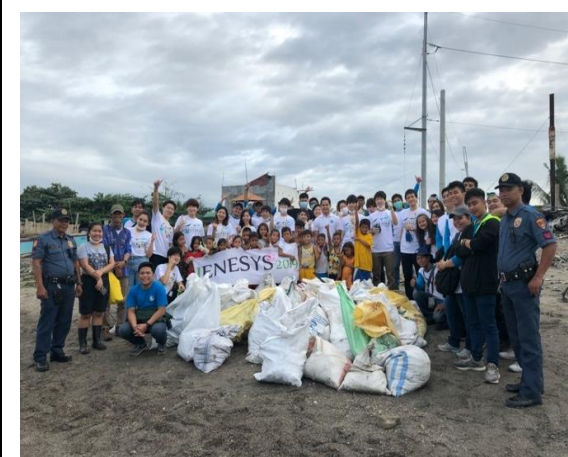
February, 9 [Volunteer Work] Baseco Area