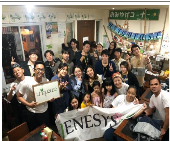
February, 10 【Company visit】 UNIQUEASE