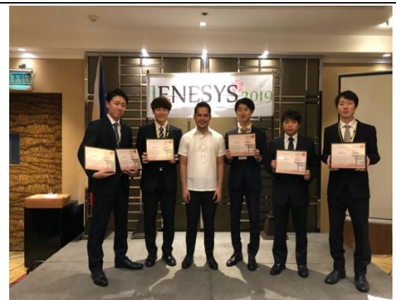
February, 11 【Conferment of Certificate】