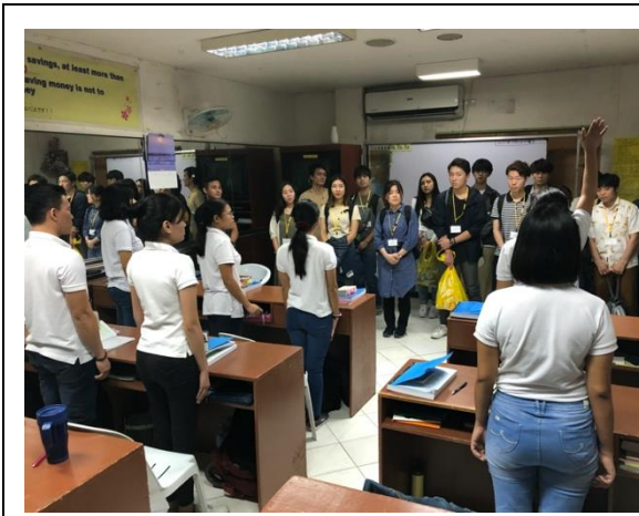
February, 10 【School Exchange】 Sakura Japanese Language School