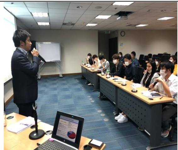
February, 6 [Visit] JICA