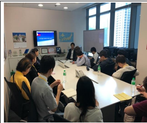
February, 6 JTB ASIA PACIFIC PHIL.CORP