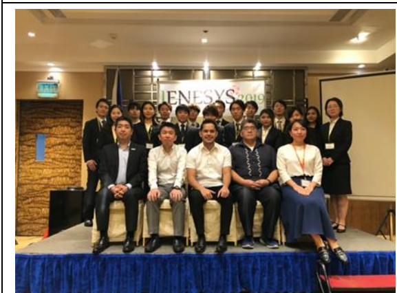
February, 11 【Reporting Session】