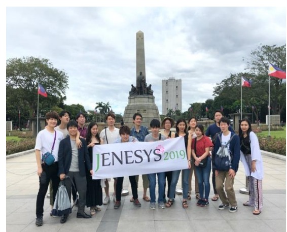
February, 9 [City observation] Manila City