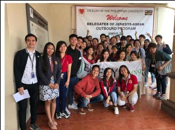
February, 7 [School Exchange] Lyceum of the Philippines University