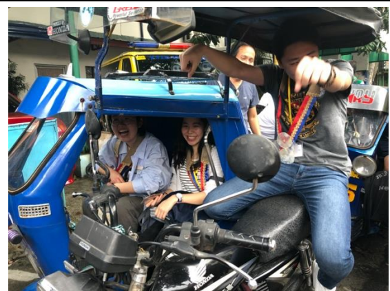
February, 8 [Home visit] Veterans Village area, Quezon City