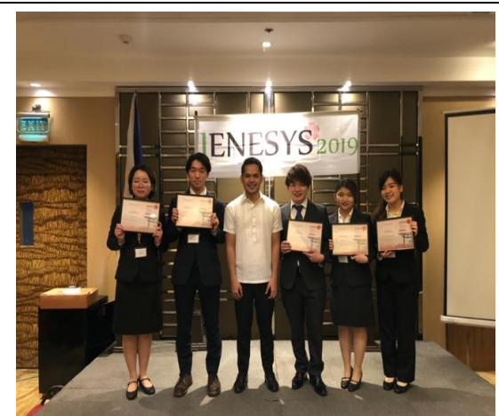
February, 11 【Conferment of Certificate】