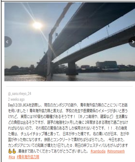
A post about visiting JICA “Japan’s contribution to Cambodia” (Instagram) : Japan assists Cambodia in various ways.