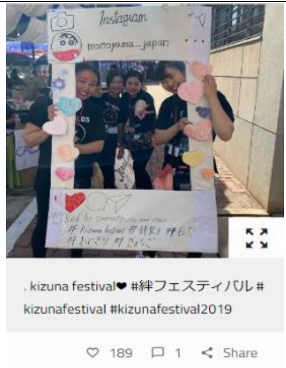
Post about KIZUNA Festival (Instagram)