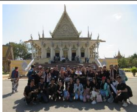
February 22nd 【Observation】 Royal Palace with students of Norton University