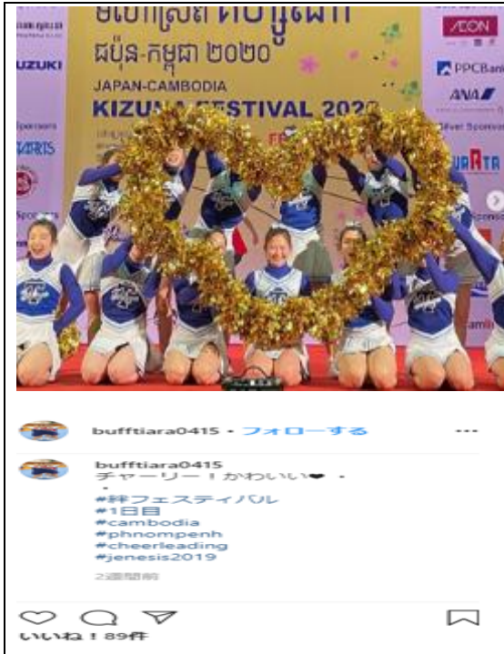
Post about KIZUNA Festival (Briefing on Cheerleading and Performance) : Want to appeal the attraction of Cheerleading (Instagram)