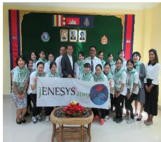
February 24th 【Courtesy Call】 Ministry of Education, Youth, and Sports