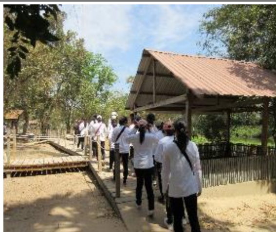
February 23rd 【Observation】 Killing Field