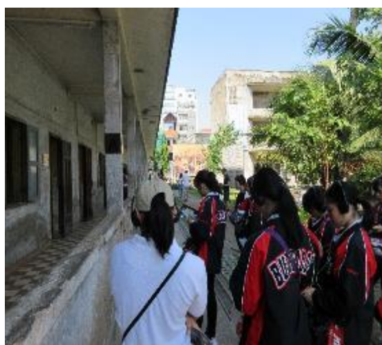
February 24th 【Observation】 Tuol Sleng Museum