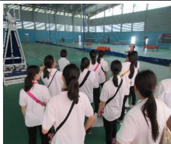
February 24th 【Japanese Company Visit】 Platinum Sports Center