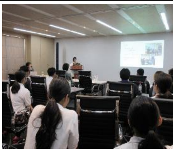
February 25th 【Reporting Session】