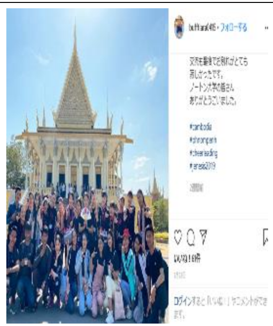
A post about Royal Palace, with students of Norton University